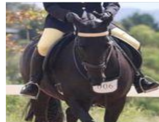
Darcy Park Show Standardbreds